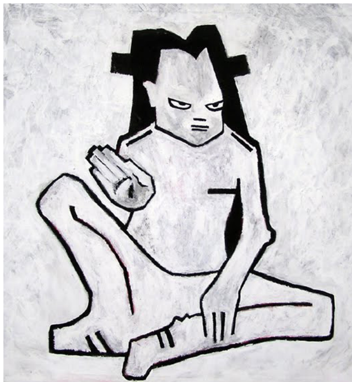
Addidas als Leitmotiv (1999)

In der globalen Hyperkultur besteht unser aller Alltag vor allem aus Business und Performance. Das ist stressig. Das House of Hyperculture bietet eine persönliche Tankstelle für Reflexion, Gemeinschaft, Training und Authentizität. So wie früher in der Dorfkirche, wo man hinging zum Singen und Beten, zum Erzählen und Zuhören, zum Trauern und Feiern. Bevor man schließlich im Jenseits landete.