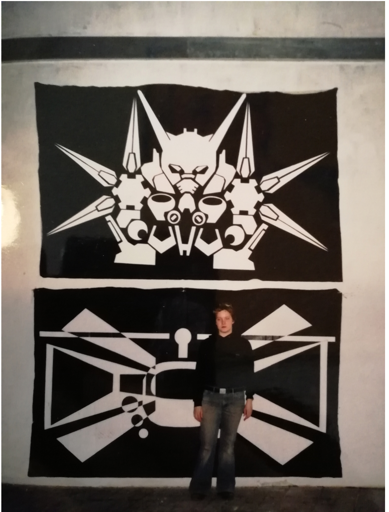
© Julia Seyr, Helicopter with Speakers (2001) & Manga (2002)